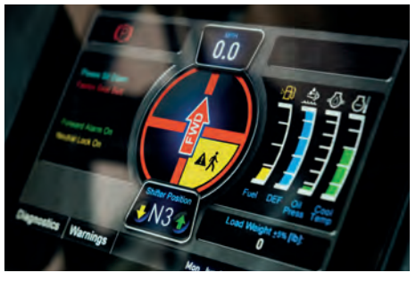
4-Zone Displays (Vision Plus<sup>™</sup> Integrated Display Shown)