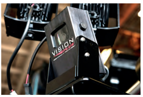
Industrial Grade Components Weather Sealed For Long Life

The Vision Plus System Combines Vehicle Speed, Vehicle Direction And Pedestrian Location To Reduce The Number Of Alerts To The Operator, Making The Warnings More Effective.