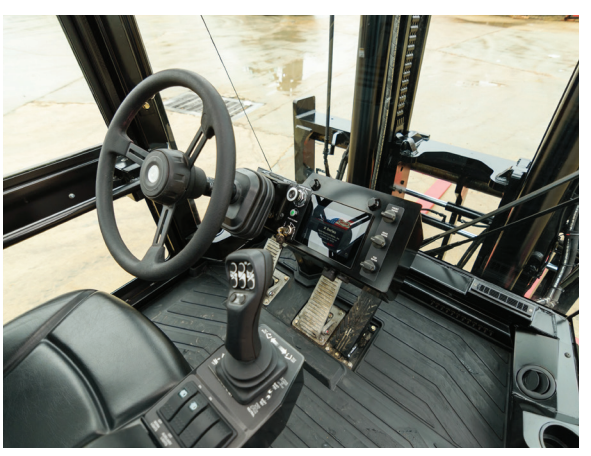
Fully Enclosed 2-Door Cab with Multiple Climate Control Configurations Available (featured cab is shown with available options)