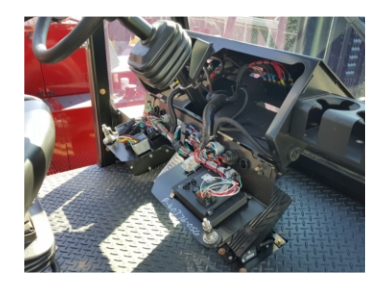
Flip-down Dash with Color/Number Coded Wiring (Standard)

Taylor Lift Trucks are designed with ease of maintenance and serviceability as a key priority. With today's engine and emissions requirements, daily maintenance checks and timely periodic service are the key to your equipment's longevity. All daily checks across the Taylor product line can be accessed from the ground or running board, ensuring that operators can complete these requirements with ease. Also, the sliding hood (on rollers), side service doors and removable floor panels open to expose the drive train and hydraulics to provide easy access for service and inspection.