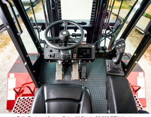
Fully Enclosed 2-door Cab - All Steel - 32,000 BTU Heater (Standard)