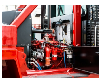
Easy Access to Drive Train & Hydraulics