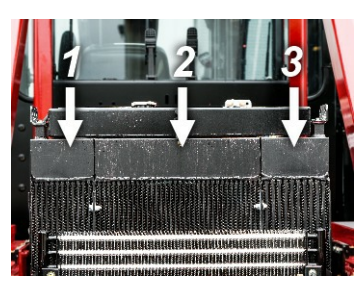
3-Section Bolted Radiator (Each section can be serviced separately)