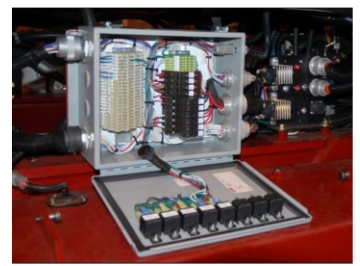
Heavy Duty Circuit Breakers/Reset Switches (Standard)