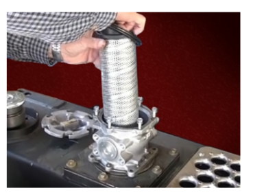
Spin-on Breather, Wire Mesh Strainer & Replaceable Internal Element (Standard)