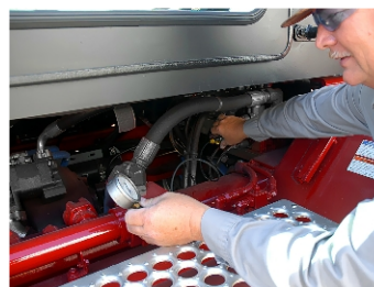
Service & Inspection from Ground Level