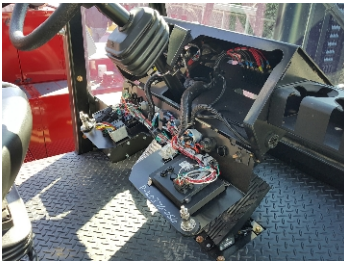
Flip-down Dash with Color/Number Coded Wiring (Standard)

Taylor Lift Trucks are designed with ease of maintenance and serviceability as a key priority. With today's engine and emissions requirements, daily maintenance checks and timely periodic service are the key to your equipment's longevity. All daily checks across the Taylor product line can be accessed from the ground or running board, ensuring that operators can complete these requirements with ease. Also, the sliding hood (on rollers), side service doors and 70 degree tilting cab open to expose the drive train and hydraulics to provide easy access for service and inspection.