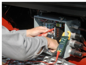
Heavy Duty Circuit Breakers/Reset Switches (Standard)