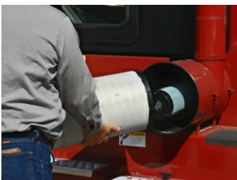
Donaldson Air Cleaner with Safety Element (Standard)