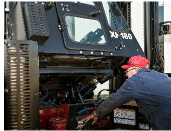
Easy Access to Drive Train & Hydraulics