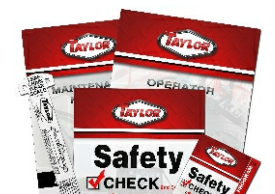
Vehicle Information Package (Standard)