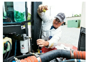
Easily Accessible Daily Checks