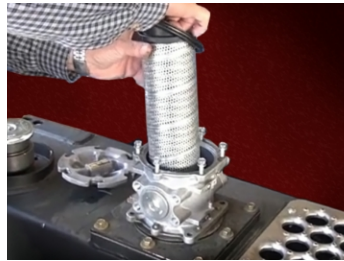
Spin-on Breather, Wire Mesh Strainer & Replaceable Internal Element (Standard)