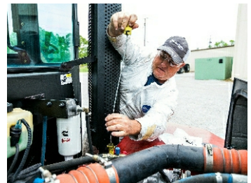
Easily Accessible Daily Checks