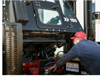
Easy Access to Drive Train & Hydraulics