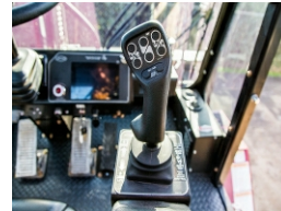
11 Button Command Joystick (Standard)