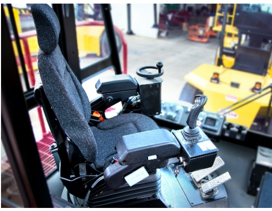
Fully Enclosed 2-door Cab - 180° Rotating Operator Platform (Standard)