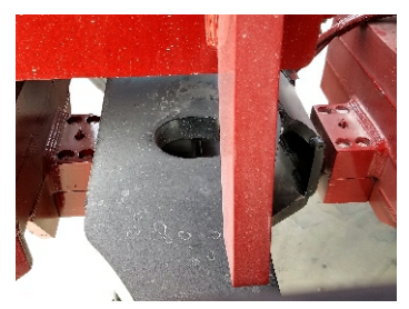
Steer Axle Pivots, 4 Bolt Mounting with Grease Fittings