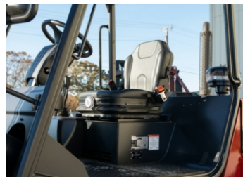
Adjustable Black Vinyl Mechanical Suspension Seat. Adjustable Weight Range to 370 lbs