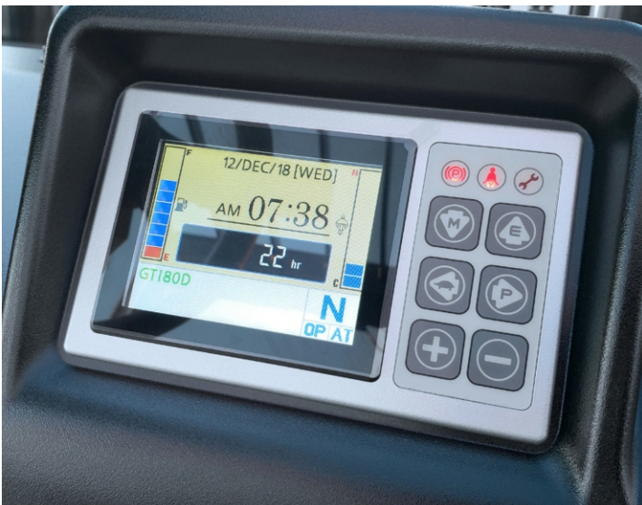
Weather Sealed High Visibility LCD Diagnostic Display Includes Fault Code Storage and is Password Protected

Taylor Machine Works was founded on the promise of meeting our customer's needs. The sign on our original facility in 1927 stated "We Engineer and Build What You Need" and those ideals still ring true today! From multiple Mast, Carriage and Fork configurations to Special Attachments that are unique to your business, we will step forward to meet the challenge. With hundreds of options readily available for our trucks, and the ability to custom engineer any other need that arises, Taylor Machine Works is here ready to serve.