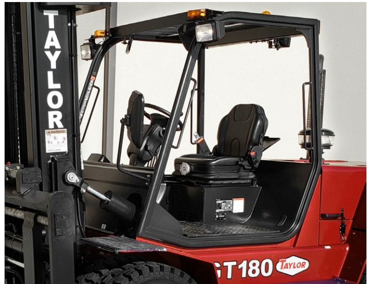
Isolation Mounted Open Operator Base with Overhead Guard