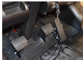
Two Pedal Hydraulic Inching & Brake and Moulded Rubber Floormat