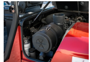
Donaldson Air Cleaner with Safety Element