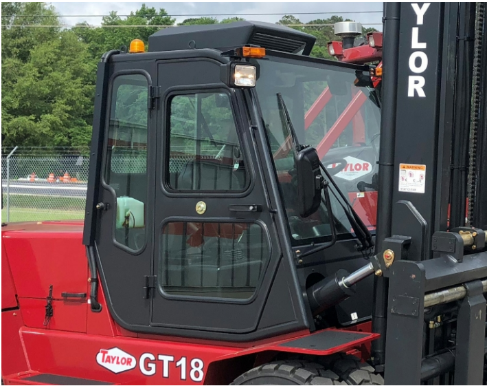
Optional Fully Enclosed & Partial Cabs Available