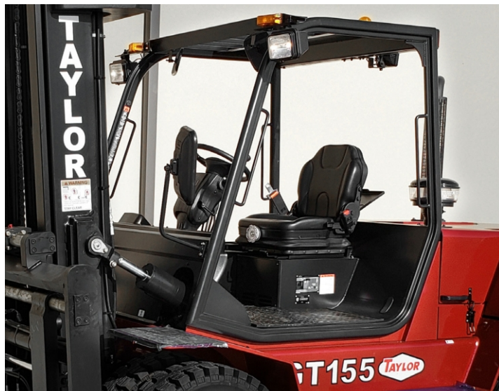
Isolation Mounted Open Operator Base with Overhead Guard