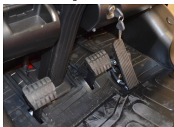
Two Pedal Hydraulic Inching & Brake and Moulded Rubber Floormat