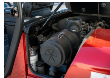
Donaldson Air Cleaner with Safety Element