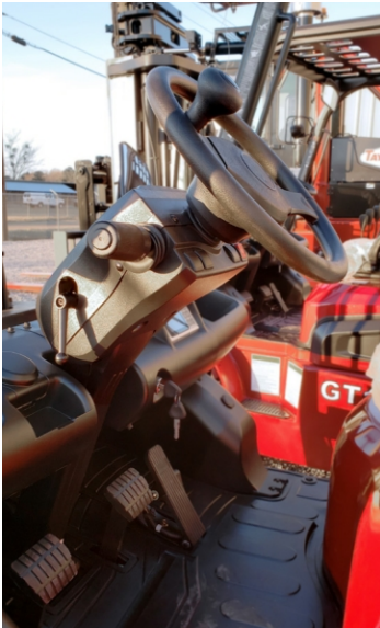
Adjustable Steering Column Pivots 30 Degrees