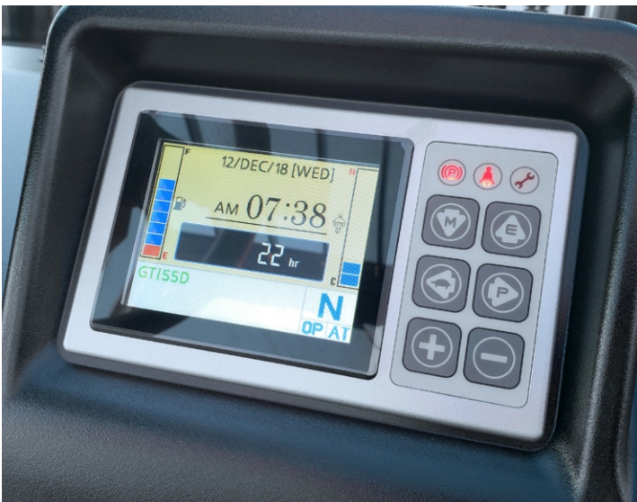
Weather Sealed High Visibility LCD Diagnostic Display Includes Fault Code Storage and is Password Protected

Taylor Machine Works was founded on the promise of meeting our customer's needs. The sign on our original facility in 1927 stated "We Engineer and Build What You Need" and those ideals still ring true today! From multiple Mast, Carriage and Fork configurations to Special Attachments that are unique to your business, we will step forward to meet the challenge. With hundreds of options readily available for our trucks, and the ability to custom engineer any other need that arises, Taylor Machine Works is here ready to serve.