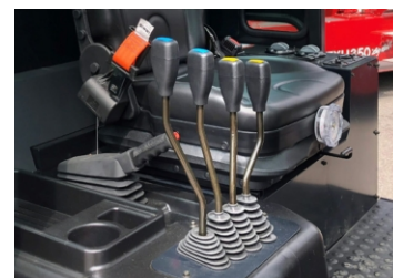
Hydraulic Control Levers and Ratchet Style Hand Brake