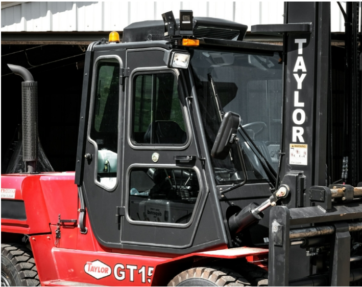
Optional Fully Enclosed & Partial Cabs Available