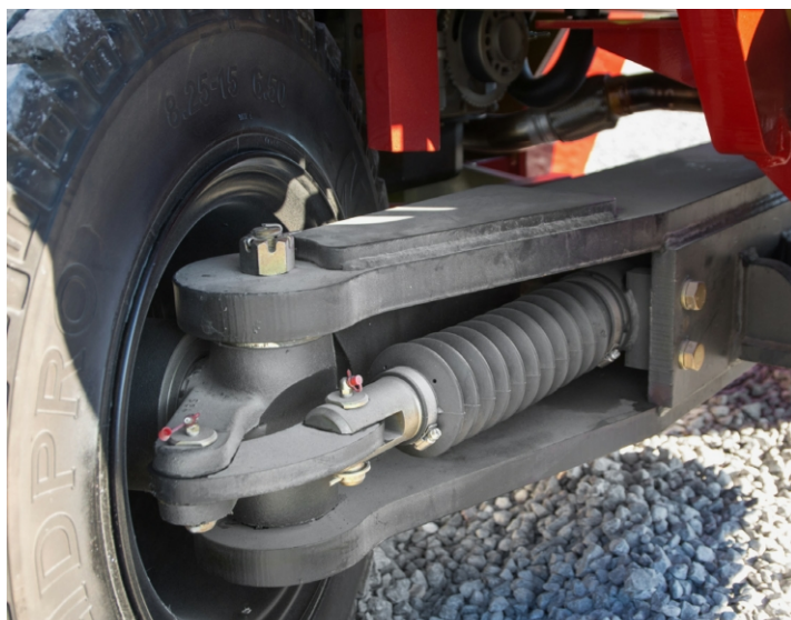
Heavy Duty Steer Axle Mounted on Rubber Isolators. Toughest Steer Axle Profile Available